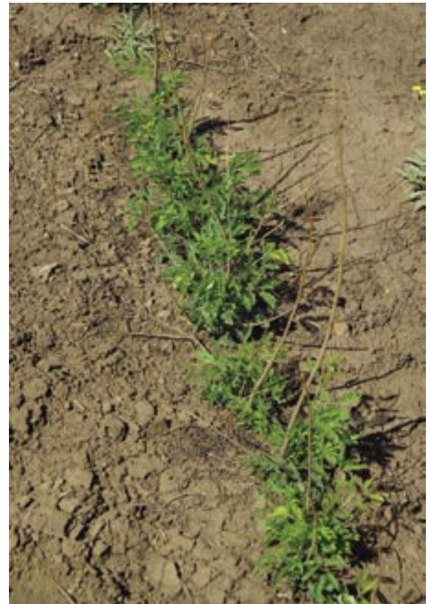
Above. Leucaena seedlings recovering from the base after being frosted.