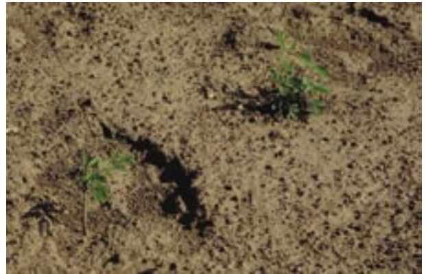
Top. These very small seedlings survived frost.

The photo below was taken in mid-June the day after a good frost touched the young leaflets. Subsequent frosts dropped all the leaf in this young leucaena. The photos on the right were taken in mid-September and show that even very young seedlings have survived., although other seedlings look as if they have been killed completely.