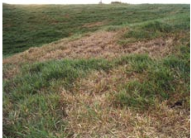
Patches of dead signal grass after attack by leaf hoppers

hopper activity and damage, but beef producers usually need to spray affected patches to stop the hoppers spreading. Control is usually by spraying insecticides with a short withholding period, such as carbaryl.