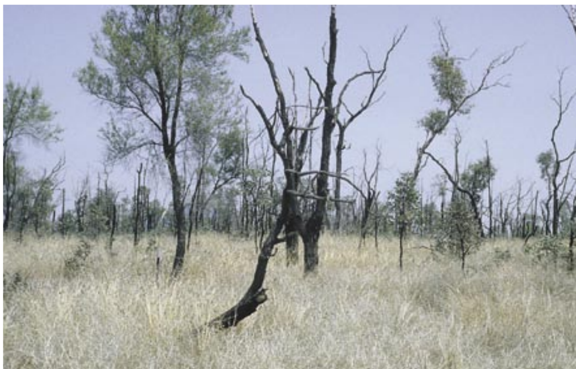
Kill mature trees, allow regrowth, then tordon again to lock up carbon?

standing trunks. This will allow new woody growth from the suppressed suckers and seedlings.