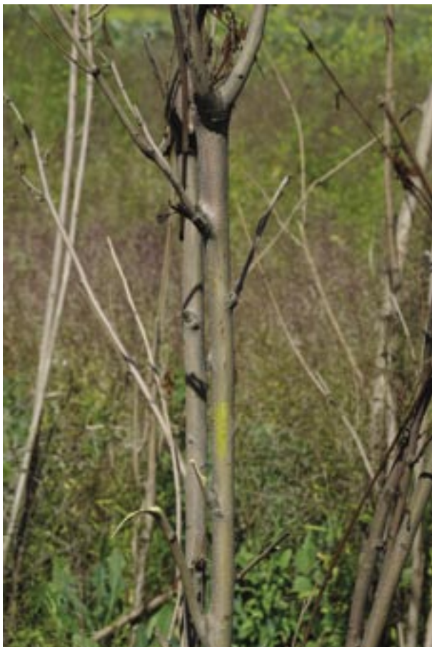
Left. These apparently dead leucaena stems still have green bark.