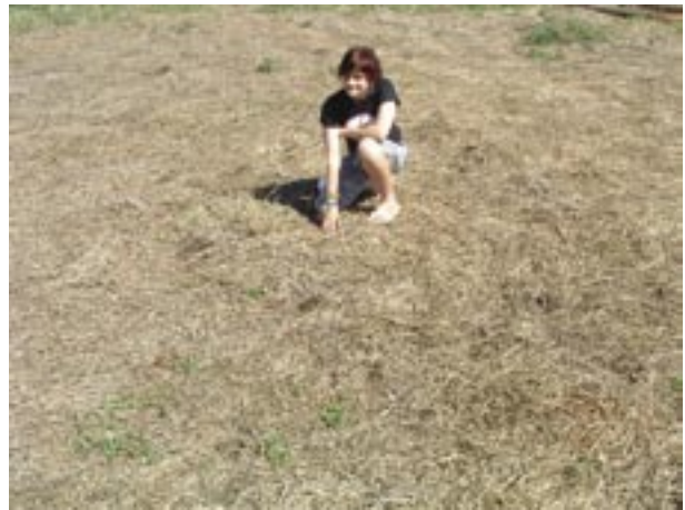
Brylee English looks at signal grass killed by frost on the Tableland. Below. New signal grass seedlings will need careful grazing management to return to productive pasture.

Rainfall over 25 mm seems to suppress the leaf